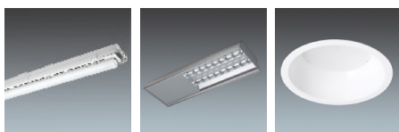
AquaForce II LED HiPak Pro LED Cetus LED