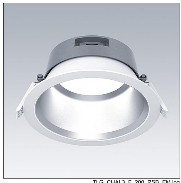
TLG CHAL3 F 200 RSB EM.jpg