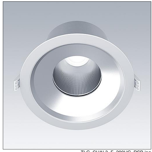
TLG CHAL3 F 200HC RSB.jpg