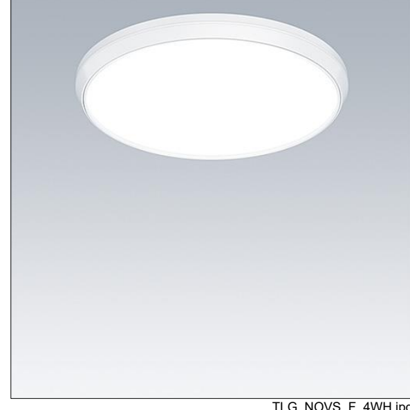
TLG NOVS F 4WH.jpg