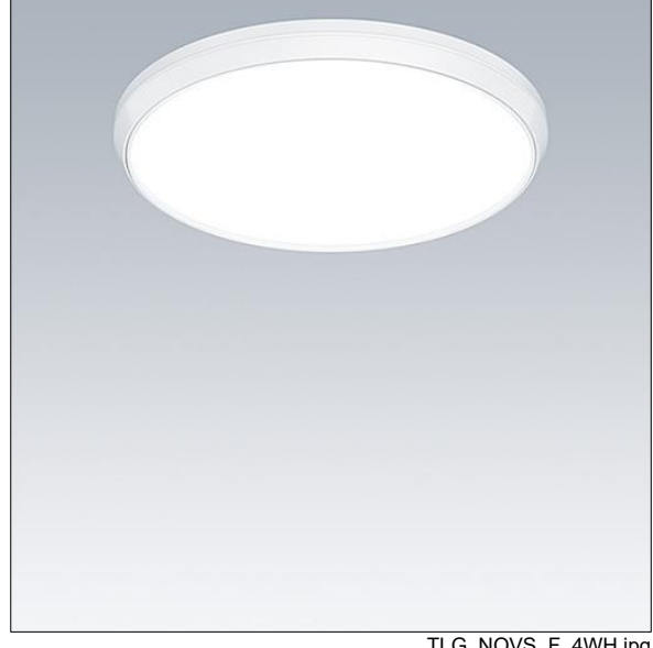
TLG NOVS F 4WH.jpg