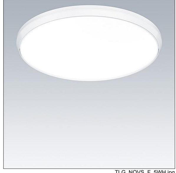
TLG NOVS F 5WH.jpg