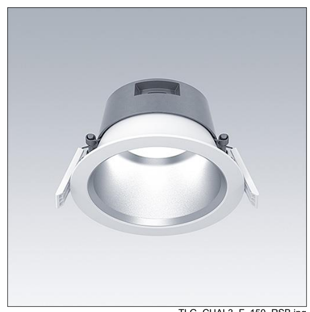
TLG CHAL3 F 150 RSB.jpg