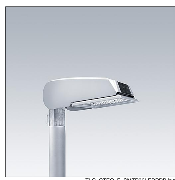
TLG CTEQ F SMTP36LEDPDB.jpg

Weight: 5.77 kg Scx: 0.077 m<sup>2</sup>