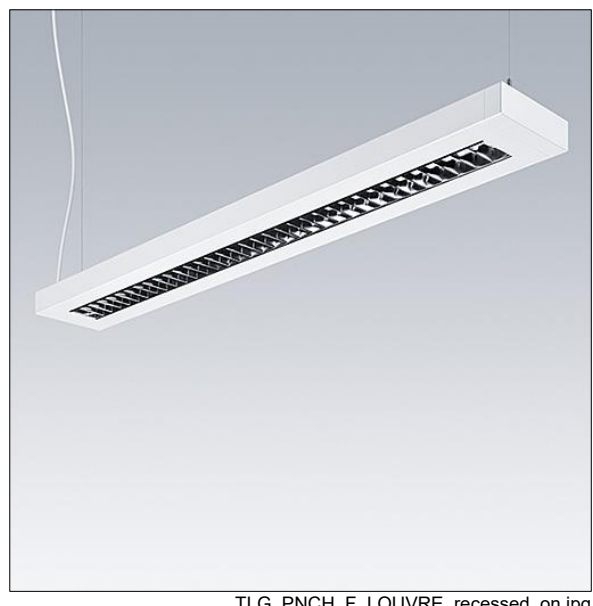
TLG PNCH F LOUVRE recessed on jpg