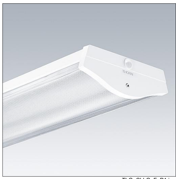
TLG CLLG F P1.jpg