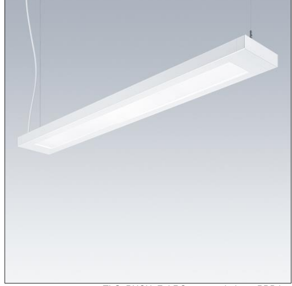
TLG PNCH F LRO suspended on PDB.jpg