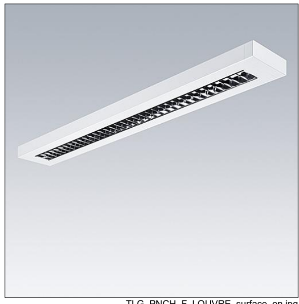
TLG PNCH F LOUVRE surface on jpg