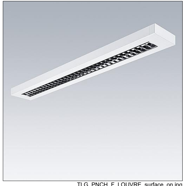
TLG PNCH F LOUVRE surface on jpg