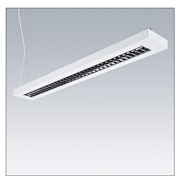
TLG PNCH F LOUVRE recessed on jpg

Dimensions: 1581 x 162 x 56 mm Luminaire input power: 48 W Luminaire luminous flux: 7091 lm Luminaire efficacy: 148 lm/W Weight: 3.8 kg