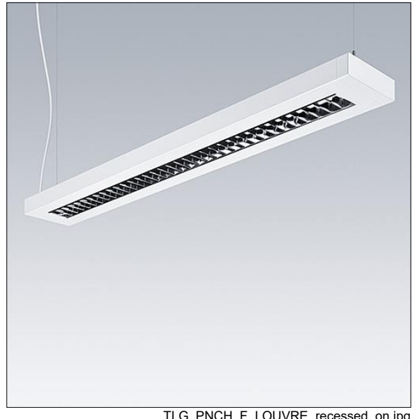
TLG PNCH F LOUVRE recessed on jpg