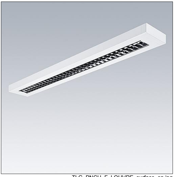
TLG PNCH F LOUVRE surface on jpg