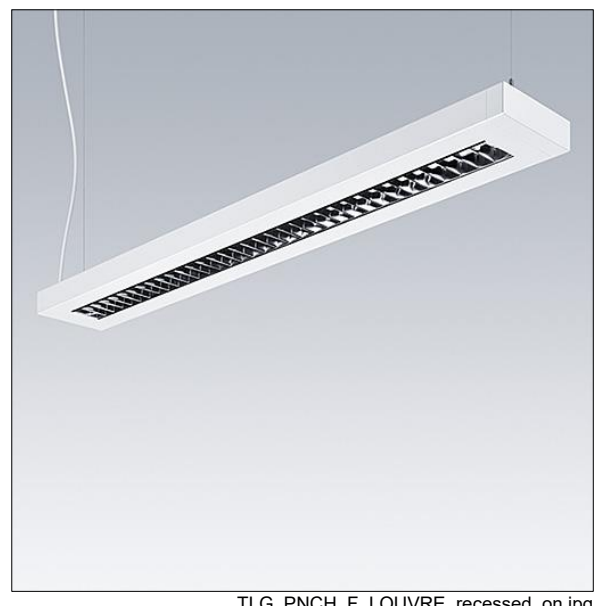
TLG PNCH F LOUVRE recessed on jpg