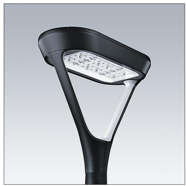
TLG URBD F MTPPDB.jpg

Dimensions: 510 x 241 x 474 mm Luminaire input power: 69.8 W Luminaire luminous flux: 10264 lm Luminaire efficacy: 147 lm/W Weight: 7.29 kg Scx: 0.049 m<sup>2</sup>