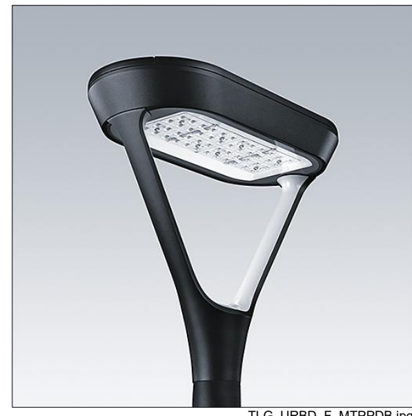
TLG URBD F MTPPDB.jpg

Weight: 7.29 kg Scx: 0.049 m<sup>2</sup>