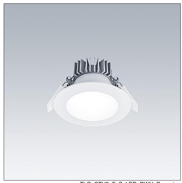
TLG CTU3 F S LED RWH Persp.jpg