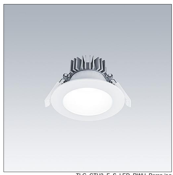
TLG CTU3 F S LED RWH Persp.jpg