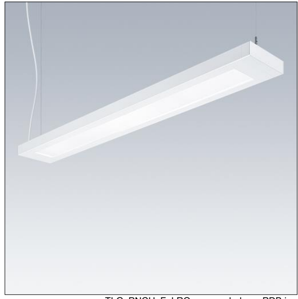
TLG PNCH F LRO suspended on PDB.jpg