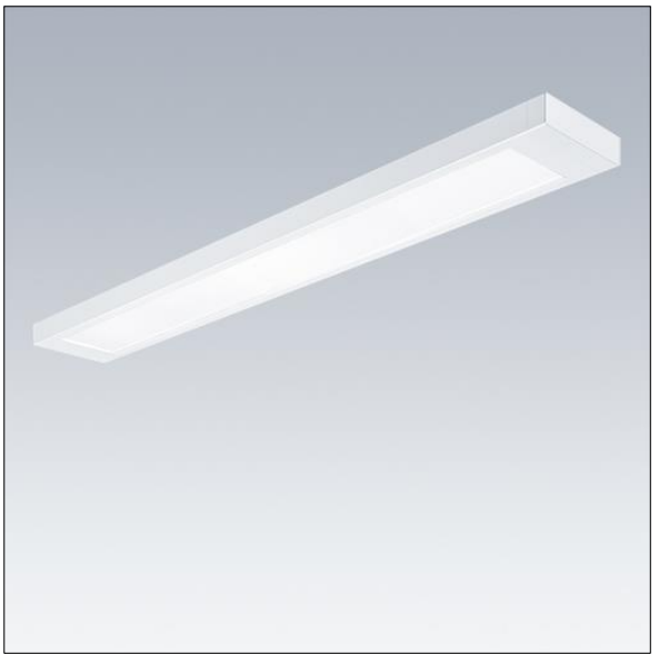
TLG PNCH F LRO surface on PDB.jpg