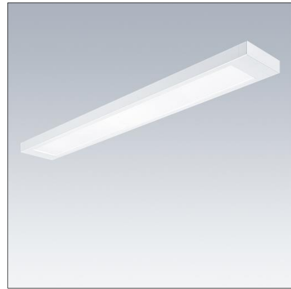
TLG PNCH F LRO surface on PDB.jpg