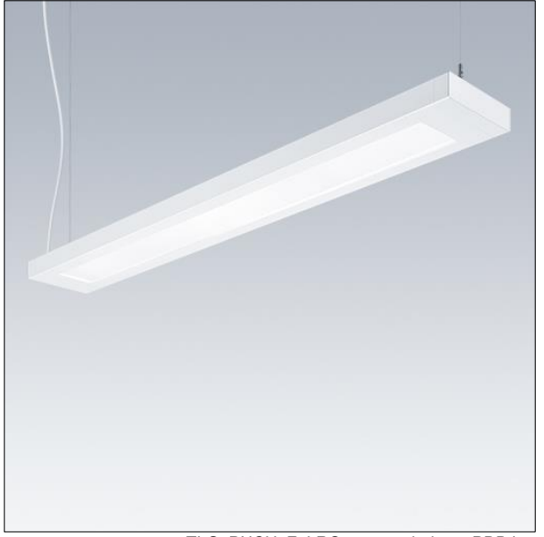
TLG PNCH F LRO suspended on PDB.jpg