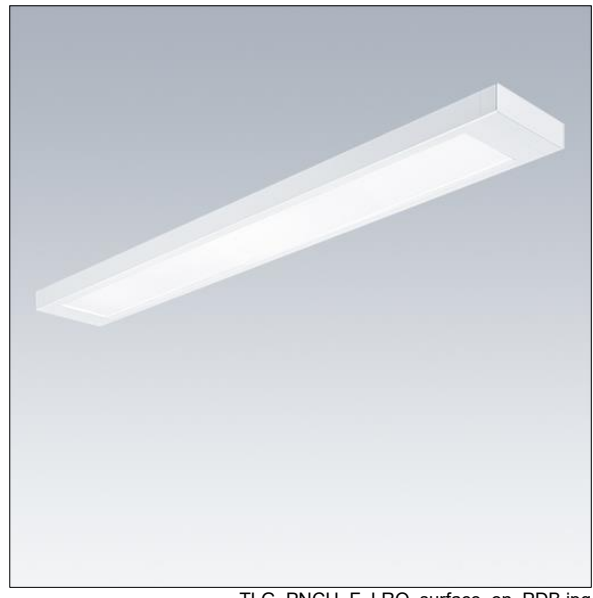
TLG PNCH F LRO surface on PDB.jpg