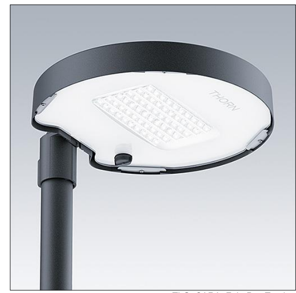
TLG CARA F L PostTop.jpg