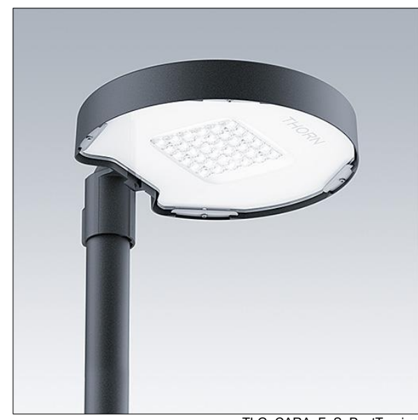
TLG CARA F S PostTop.jpg