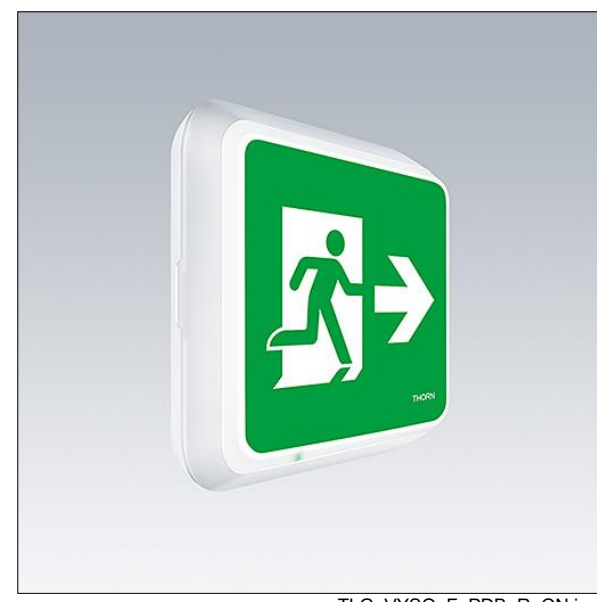
TLG VYSQ F PDB R ON.jpg

A slim, square, surface mounted, LED safety sign luminaire. Luminaire for central emergency light supply, with circuit monitoring, without single monitoring of the luminaire. NFC interface for maintenance via PROset Pen (article: 22170290) or PROset app. Power supply: 220-240 Vac (± 10%), 50/60 Hz; 176-280 Vdc. Body: injection moulded polycarbonate,. Diffuser: opal polycarbonate, with glued, printed emergency exit direction arrow (right) pictogram according to ISO 7010. Uniform backlighting of pictogram, luminance > 500 cd/m² in the white region and 200 cd / m² on average in mains mode (according to DIN 4844), 2 cd / m² minimum in emergency mode (according to EN 1838). Recognition distance according to EN 1838: 44m. Class II electrical, IP65, Impact strength: IK10. ambient temperature: -30°C to +35°C. Suitable for direct mounting to wall. Loop-in, loop-out is possible for cables up to 2.5 mm<sup>2</sup>. BESA compatible. Food certificate (to be used in areas with fully packaged food). Luminaire wired with halogen free and silicone free leads. Luminaire with D symbol (for use in environments in which the accumulation of conductive dust on the luminaire can be expected).