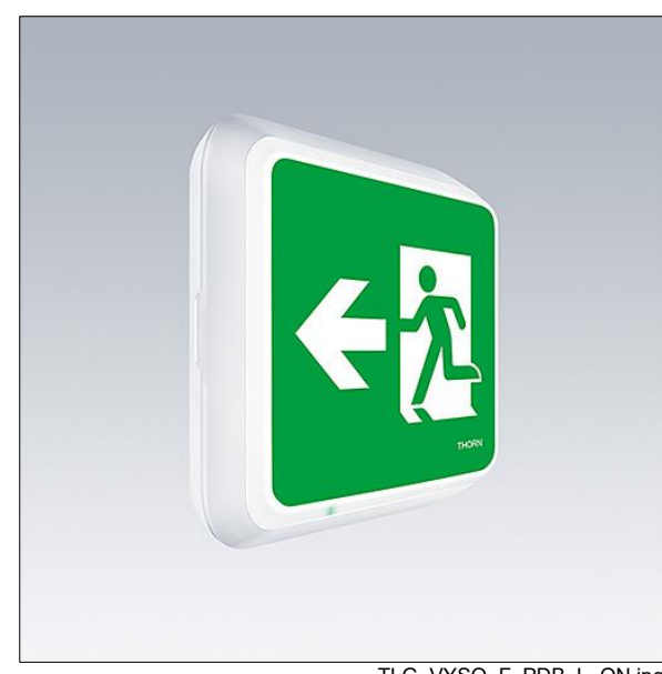
TLG VYSQ F PDB L ON.jpg

A slim, square, surface mounted, LED safety sign luminaire. Luminaire for central emergency light supply, for single luminaire monitoring via Powerline, settable emergency light level. NFC interface for addressing, configuration and maintenance via PROset Pen (article: 22170290) or PROset app, addressing also alternatively possible visually or via EZ-addressing. Power supply: 220-240 Vac (± 10%), 50/60 Hz; 176-280 Vdc. Body: injection moulded polycarbonate. Diffuser: opal polycarbonate, with glued, printed emergency exit direction arrow (left) pictogram according to ISO 7010. Uniform backlighting of pictogram, luminance > 500 cd/m² in the white region and 200 cd / m<sup>2</sup> on average in mains mode (according to DIN 4844), 2 cd / m<sup>2</sup> minimum in emergency mode (according to EN 1838). Recognition distance according to EN 1838: 44m. Class II electrical, IP65, Impact strength: IK10. ambient temperature: -30°C to +35°C. Suitable for direct mounting to wall. Loop-in, loop-out is possible for cables up to 2.5 mm². BESA compatible. Food certificate (to be used in areas with fully packaged food). Luminaire wired with halogen free and silicone free leads. Luminaire with D symbol (for use in environments in which the accumulation of conductive dust on the luminaire can be expected).