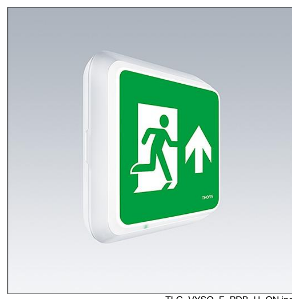
TLG VYSQ F PDB U ON.jpg

A slim, square, surface mounted, LED safety sign luminaire. Luminaire for central emergency light supply, with circuit monitoring, without single monitoring of the luminaire. NFC interface for maintenance via PROset Pen (article: 22170290) or PROset app. Power supply: 220-240 Vac (± 10%), 50/60 Hz; 176-280 Vdc. Body: injection moulded polycarbonate,. Diffuser: opal polycarbonate, with glued, printed emergency exit direction arrow (up) pictogram according to ISO 7010. Uniform backlighting of pictogram, luminance > 500 cd/m² in the white region and 200 cd / m² on average in mains mode (according to DIN 4844), 2 cd / m² minimum in emergency mode (according to EN 1838). Recognition distance according to EN 1838: 44m. Class II electrical, IP65, Impact strength: IK10. ambient temperature: -30°C to +35°C. Suitable for direct mounting to wall. Loop-in, loop-out is possible for cables up to 2.5 mm<sup>2</sup>. BESA compatible. Food certificate (to be used in areas with fully packaged food). Luminaire wired with halogen free and silicone free leads. Luminaire with D symbol (for use in environments in which the accumulation of conductive dust on the luminaire can be expected).