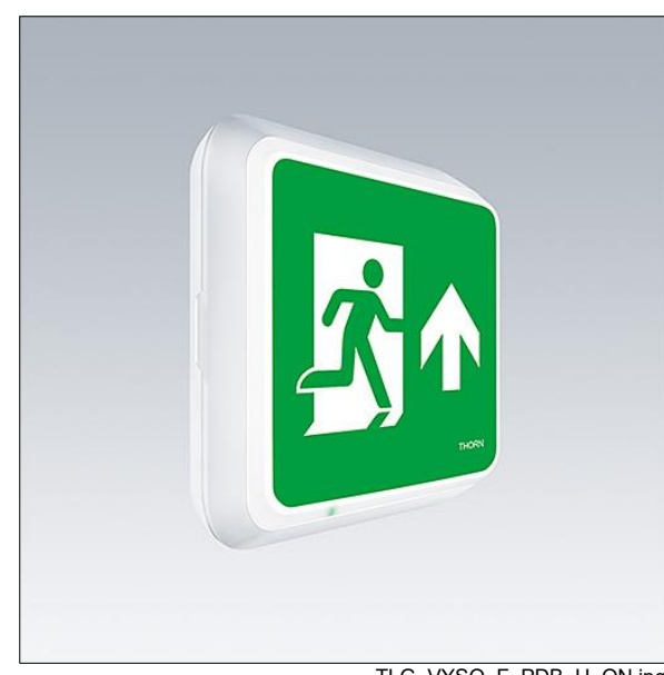
TLG VYSQ F PDB U ON.jpg

A slim, square, surface mounted, LED safety sign luminaire. Luminaire for central emergency light supply, for single luminaire monitoring via DALI (DALI-2 certified), settable emergency light level. NFC interface for addressing, configuration and maintenance via PROset Pen (article: 22170290) or PROset app, addressing also alternatively possible visually or via EZ-addressing. Power supply: 220-240 Vac (± 10%), 50/60 Hz; 176-280 Vdc. Body: injection moulded polycarbonate,. Diffuser: opal polycarbonate, with glued, printed emergency exit direction arrow (up) pictogram according to ISO 7010. Uniform backlighting of pictogram, luminance > 500 cd/m² in the white region and 200 cd / m² on average in mains mode (according to DIN 4844), 2 cd / m² minimum in emergency mode (according to EN 1838). Recognition distance according to EN 1838: 44m. Class II electrical, IP65, Impact strength: IK10. ambient temperature: -30°C to +35°C. Suitable for direct mounting to wall. Loop-in, loop-out is possible for cables up to 2.5 mm<sup>2</sup>. BESA compatible. Food certificate (to be used in areas with fully packaged food). Luminaire wired with halogen free and silicone free leads. Luminaire with D symbol (for use in environments in which the accumulation of conductive dust on the luminaire can be expected).