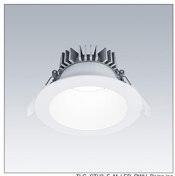
TLG CTU3 F M LED RWH Persp.jpg