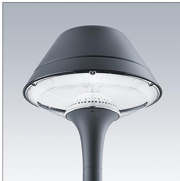
TLG PLRL F IOC ANT.jpg

Dimensions: Ø564 x 567 mm Luminaire input power: 36 W Luminaire luminous flux: 4456 lm Luminaire efficacy: 124 lm/W Weight: 9.5 kg Scx: 0.199 m 2