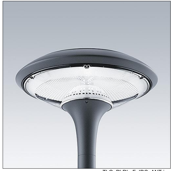
TLG PLRL F IDC ANT.jpg

Weight: 7.61 kg Scx: 0.151 m<sup>2</sup>