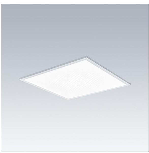
TLG OMP2 F QH PDB.jpg

Dimensions: 597 x 597 x 55 mm Luminaire input power: 27.4 W Luminaire luminous flux: 3800 lm Luminaire efficacy: 139 lm/W Weight: 5.4 kg