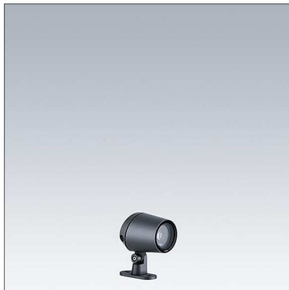
TLG CON3 F XS.jpg

Dimensions: Ø83 x 103 mm Luminaire input power: 7 W Luminaire luminous flux: 347 lm Luminaire efficacy: 50 lm/W Weight: 0.9 kg