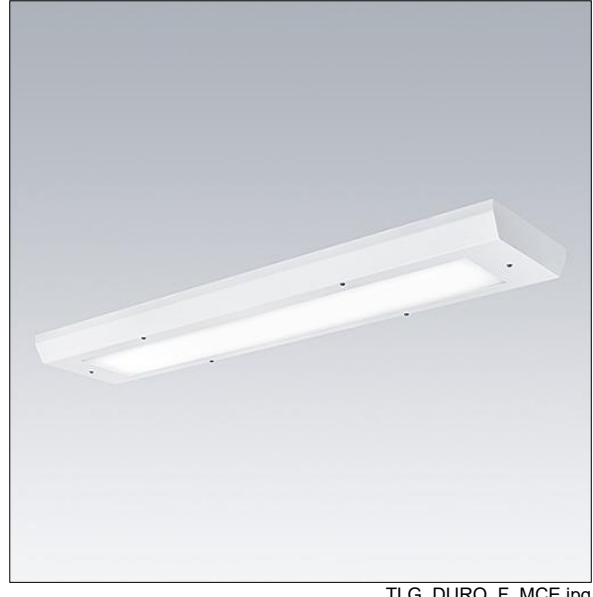
TLG DURO F MCE.jpg