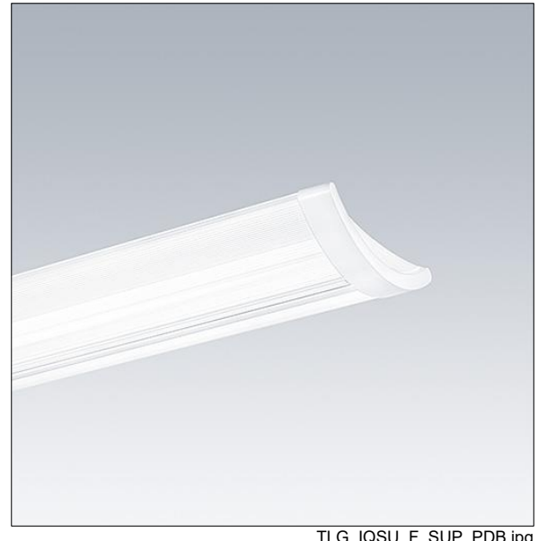
TLG IQSU F SUP PDB.jpg