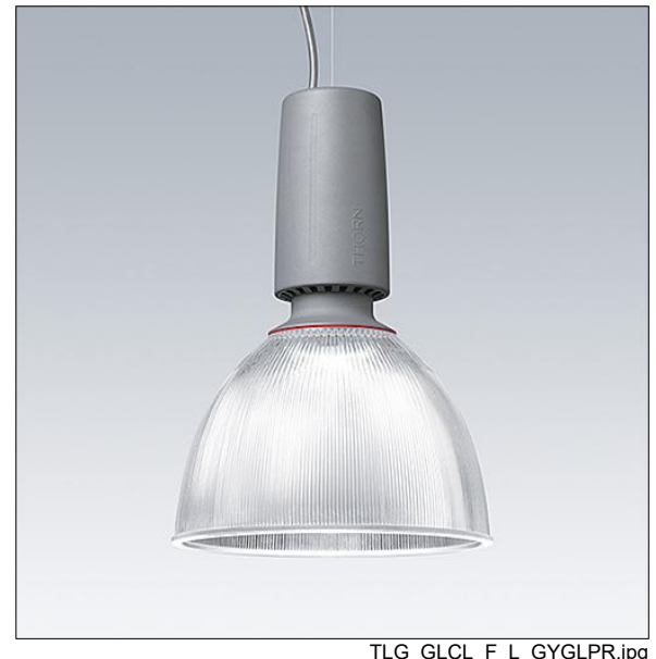
TLG GLCL F L GYGLPR.jpg