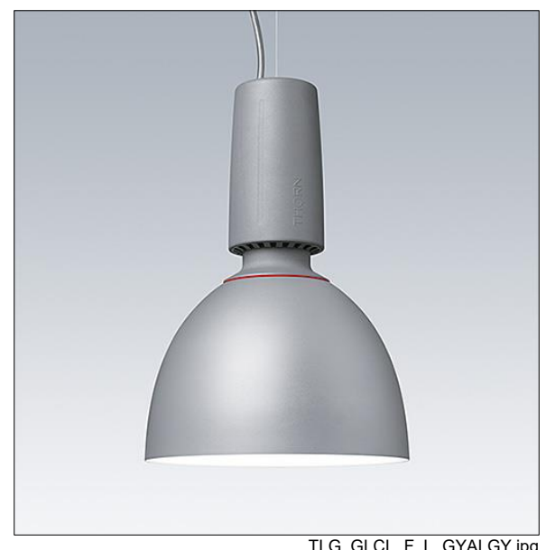
TLG GLCL F L GYALGY.jpg