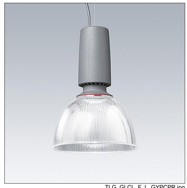
TLG GLCL F L GYPCPR.jpg