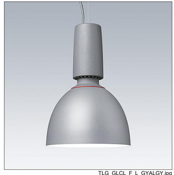
TLG GLCL F L GYALGY.jpg