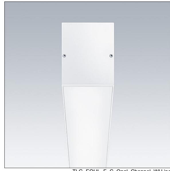
TLG EQUL F C Opal Channel WH.jpg