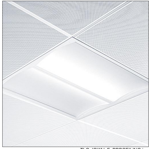
TLG IQWV F PDBCEILING.jpg