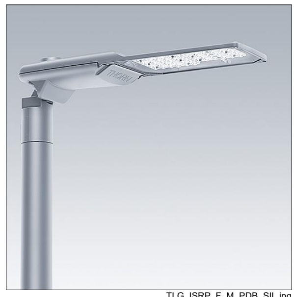
TLG ISRP F M PDB SIL.jpg