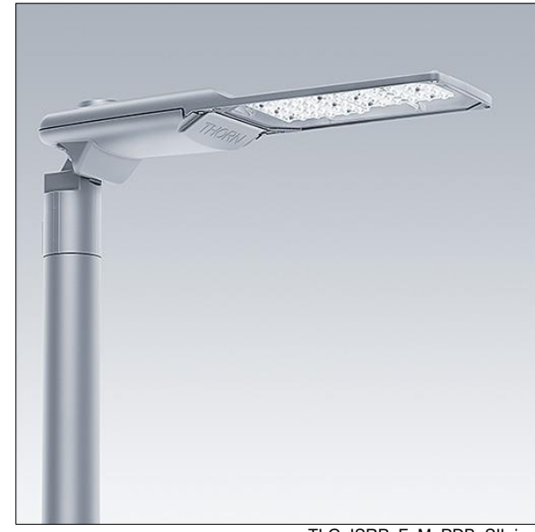
TLG ISRP F M PDB SIL.jpg