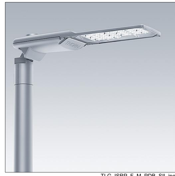
TLG ISRP F M PDB SIL.jpg