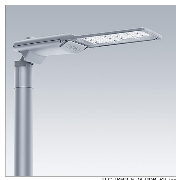
TLG ISRP F M PDB SIL.jpg