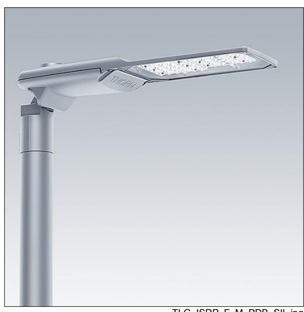
TLG ISRP F M PDB SIL.jpg